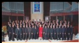
Sardis Choir & Open Hands Ministry